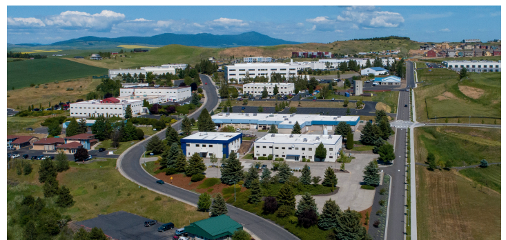
Top: Map of Tekoa Mountain Business Park. Bottom Left: Map of Whitman County. Yellow shaded portions of map indicate Opportunity Zone eligible census tracts. Bottom Right: Aerial image of Pullman Industrial Park.